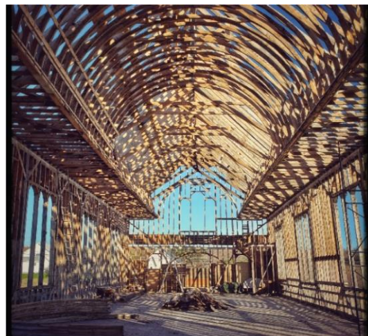
Deconstruction of a Church for salvage along the Fundy Shore, NS

Note when submitting photos, you agree to have them shared on our newsletter or social media platforms, always with credit, with the knowledge they may be cropped or altered to fit within the formatting required.